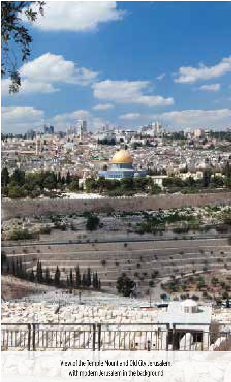
View of the Temple Mount and Old City Jerusalem, with modern Jerusalem in the background