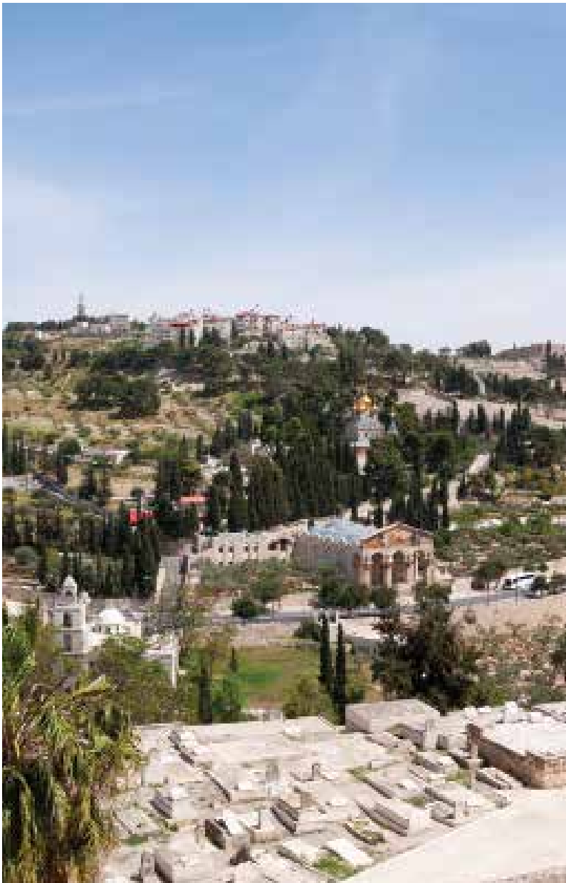
View across Kidron Valley toward Mount of Olives